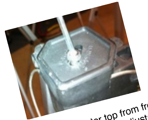
Remove polyester top from from Locate the adjustable assembly. Locate the top of each assembly at the very top of each corner cap at the very set screw.