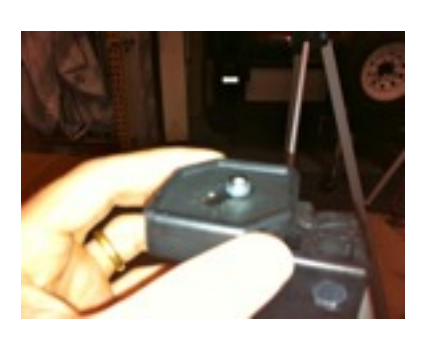
Slide the adjustable corner cap outward to allow the CRS wire to slide under.