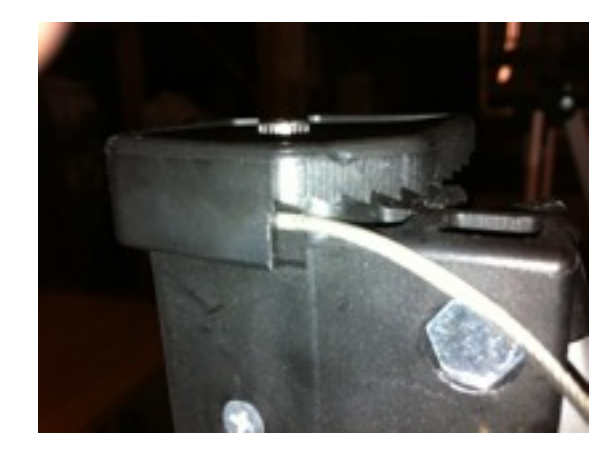
Complete Corner attachment